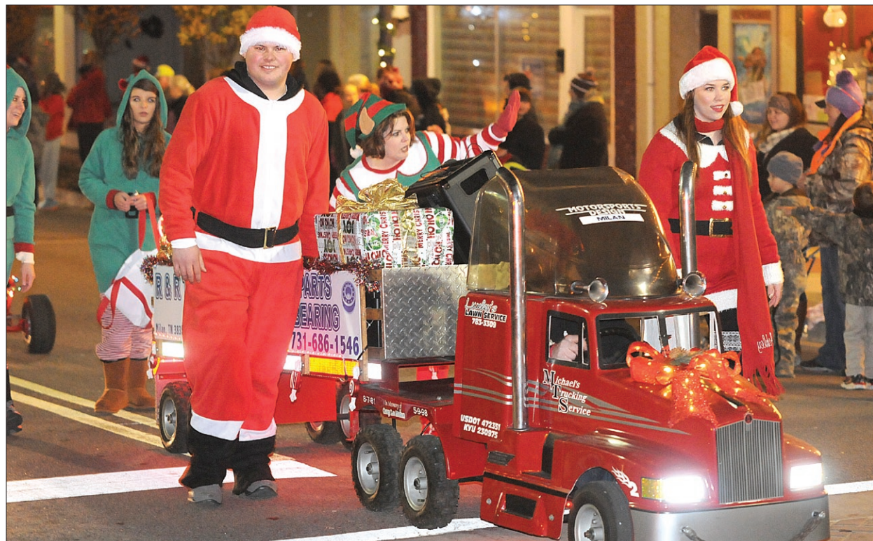
SANTA'S HELPERS - The crew of R&R Towing took third place in the Milan Christmas Parade's vehicle category with their miniature trucking rig, delivering candy and Christmas cheer to the hundreds gathered along Main Street.