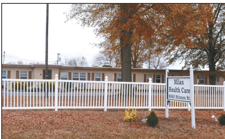
NO MORE ADMISSIONS - All new admissions to Milan Health Care Center have been suspended by the state of Tennessee and the nursing home can no longer receive payments from Medicare or Medicaid.